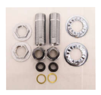
1/2" x 1/2" Hardware